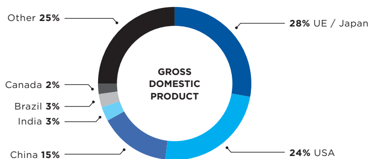
Chart 1 - GDP, Current US Dollars

The Free Trade Agreement between the two parties creates the largest free and advanced economic zone in the world with approximately 30% of the world's GDP and a population of more than 635 million people.